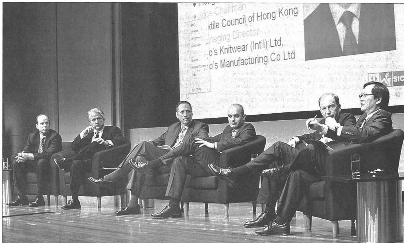
More than 60 senior executives representing the apparel industry and 400 other participants are expected to attend the Prime Source Forum.

"And, if the customer demand doesn't meet the supply, this will really hurt the